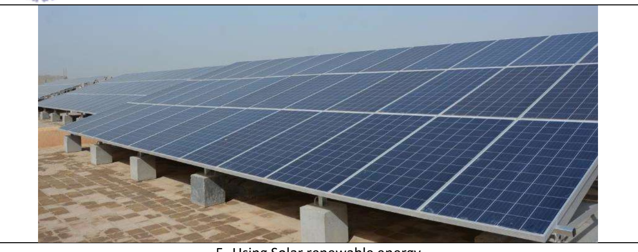
5- Using Solar renewable energy